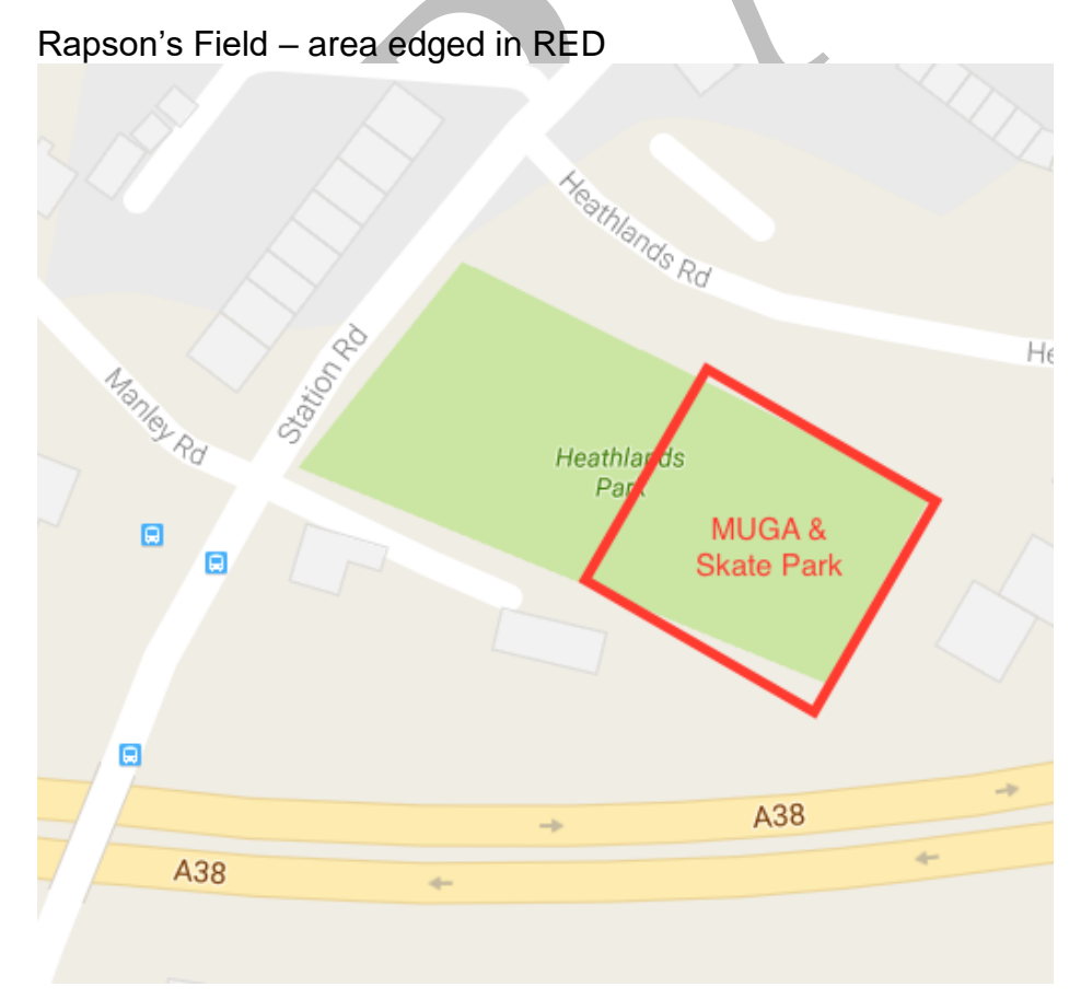
Page 9 of 15