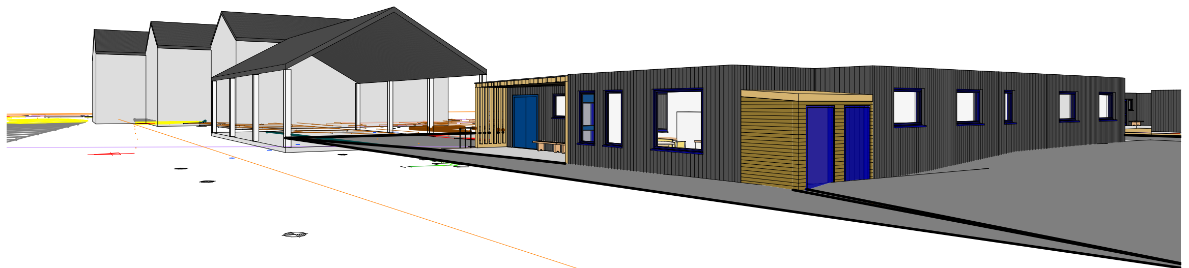
1 3D View 1

Preliminary Sketch Isometric view of work space units in context with Work Sheds and Market Canopy buildings.