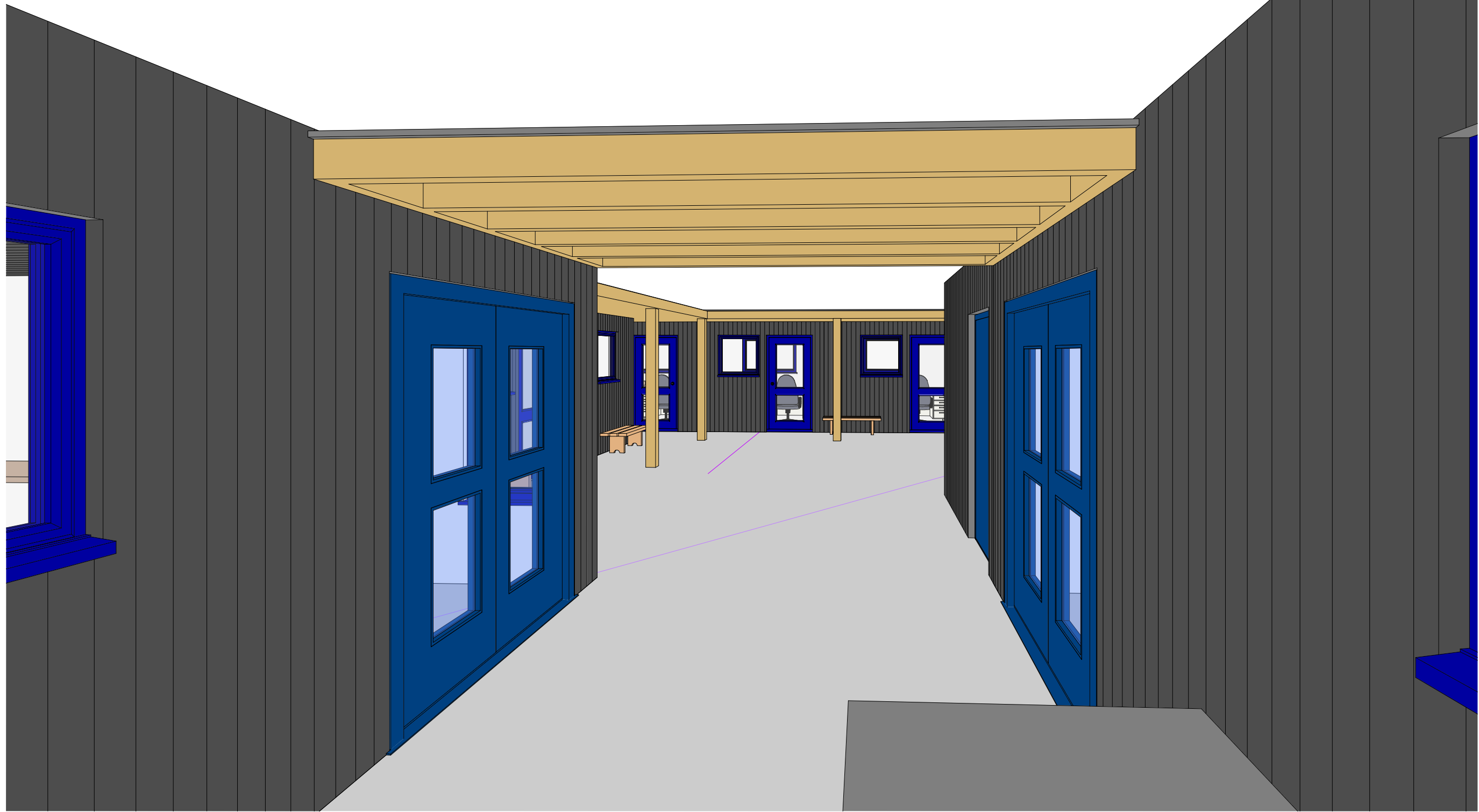
2 3D View 3

Dark painted shipping containers with natural wood contrast to reflect the materials and colours intended for the Work Sheds and Market Canopy buildings