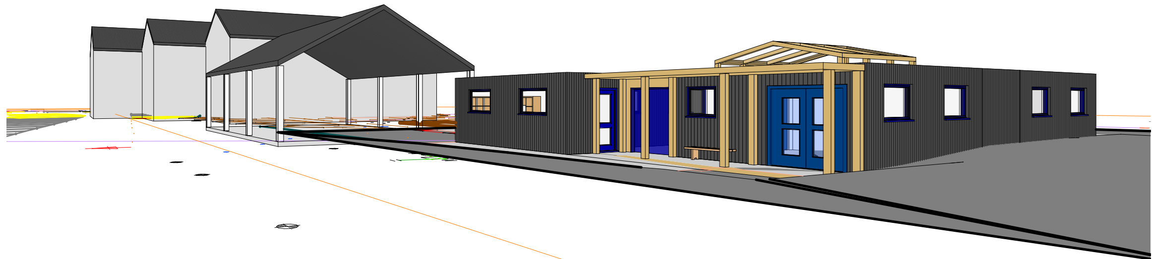
1 3D View 1

Preliminary Sketch Isometric view of work space units in context with Work Sheds and Market Canopy buildings.