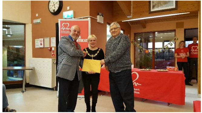
The Mayor also presented the awards at the hockey club presentation.