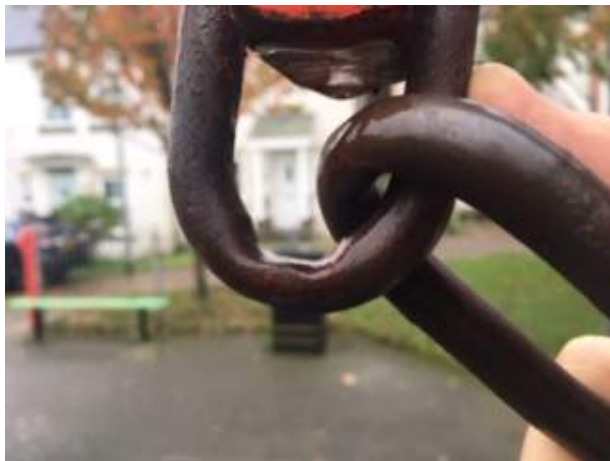
Swing shackle wear – requires replacement