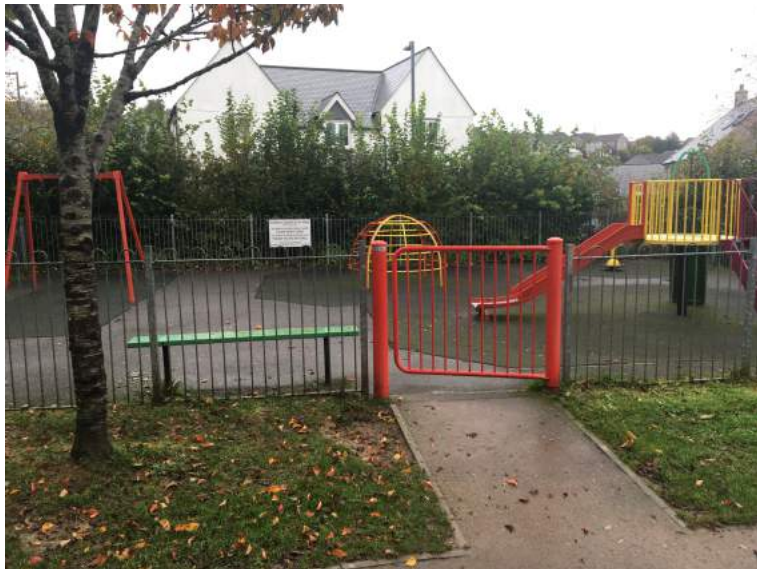
Entrance gate looking East