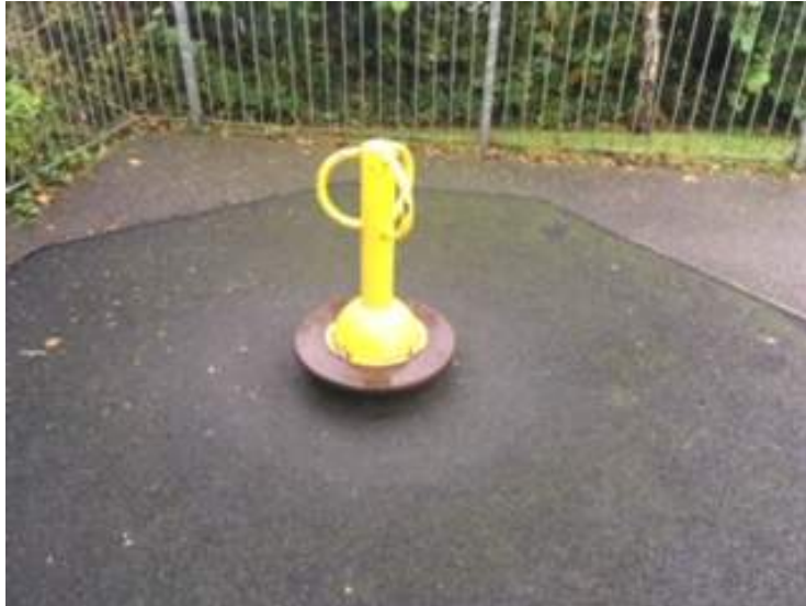
Spinner – good condition