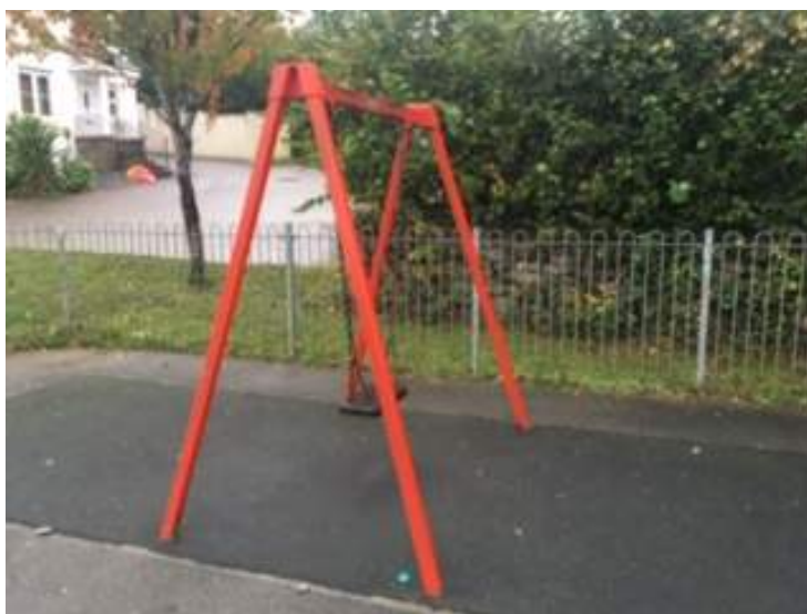
Single flat swing – good condition but see below