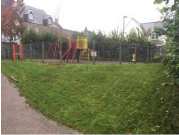
View looking North