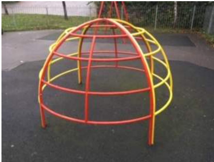
Toddler climbing frame – good condition