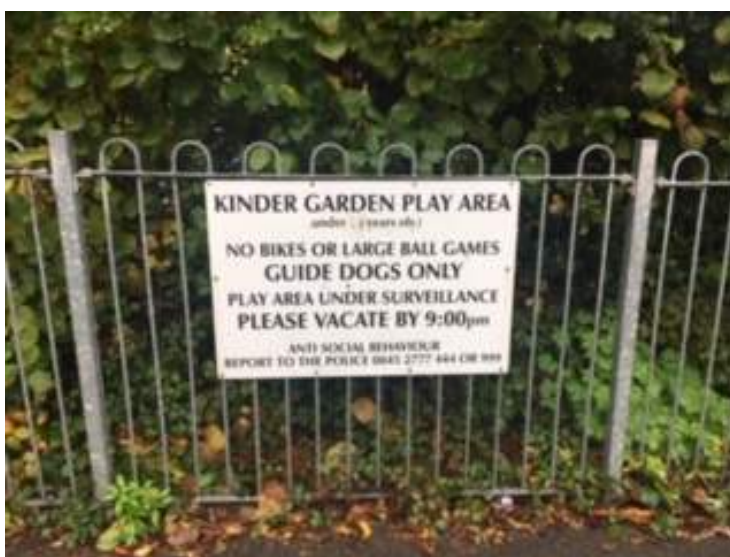
Signage requires updating