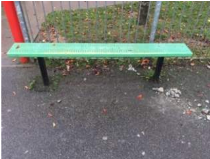
Bench – worn but sound