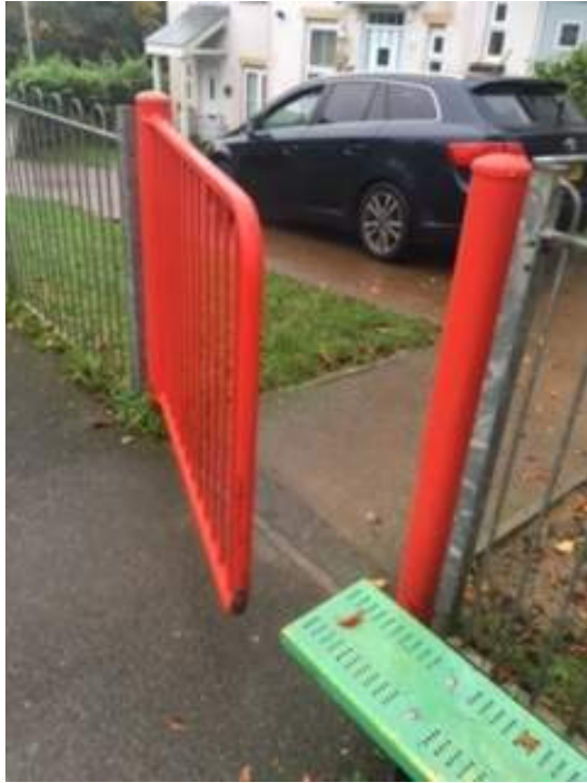
Auto close gate out of adjustment – gate opens out but may have been forced to open in – requires adjustment