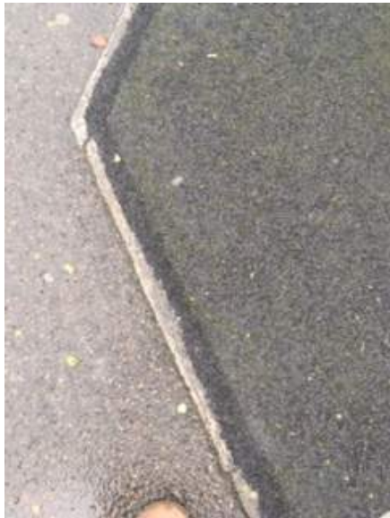
Previous repairs to Wet Pour due to shrinkage