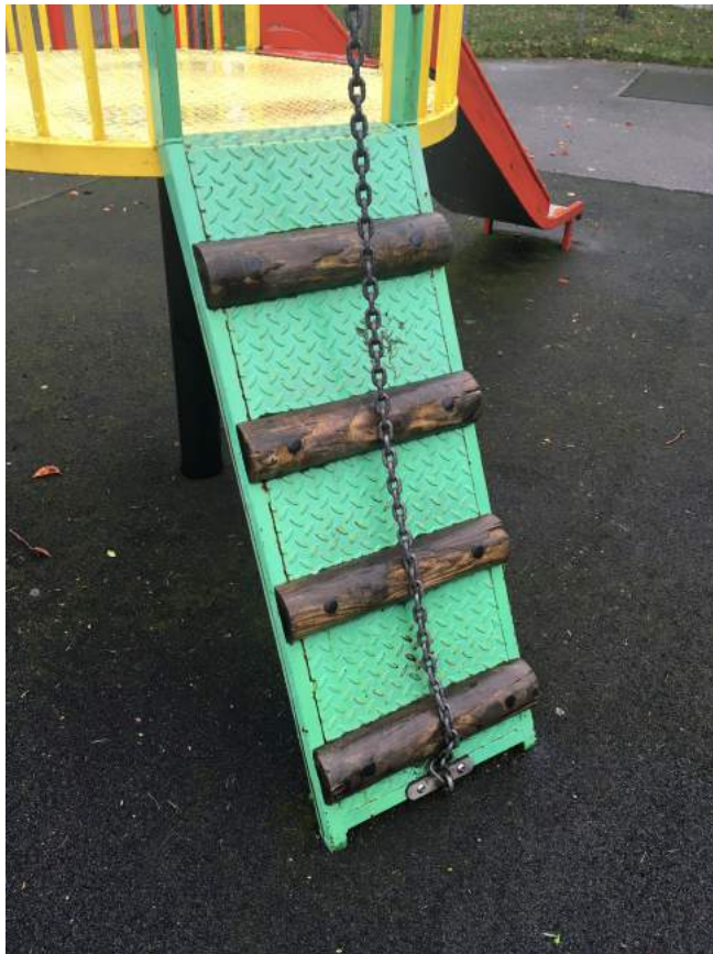
Climbing platform timber green and slippery – requires cleaning