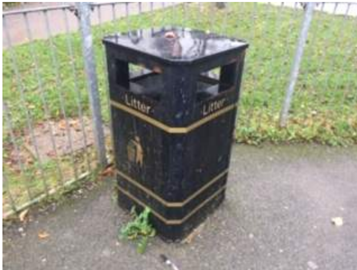
Litter Bin – locked and in good condition