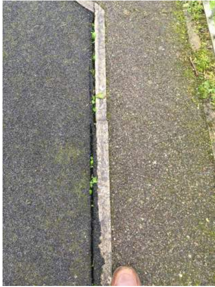
'Wet Pour' rubberised surface shrinking at edges – eventually leading to trip hazard