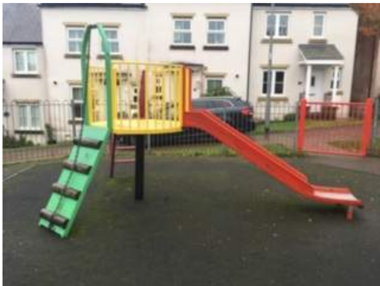
Climbing platform / slide – good condition but see below