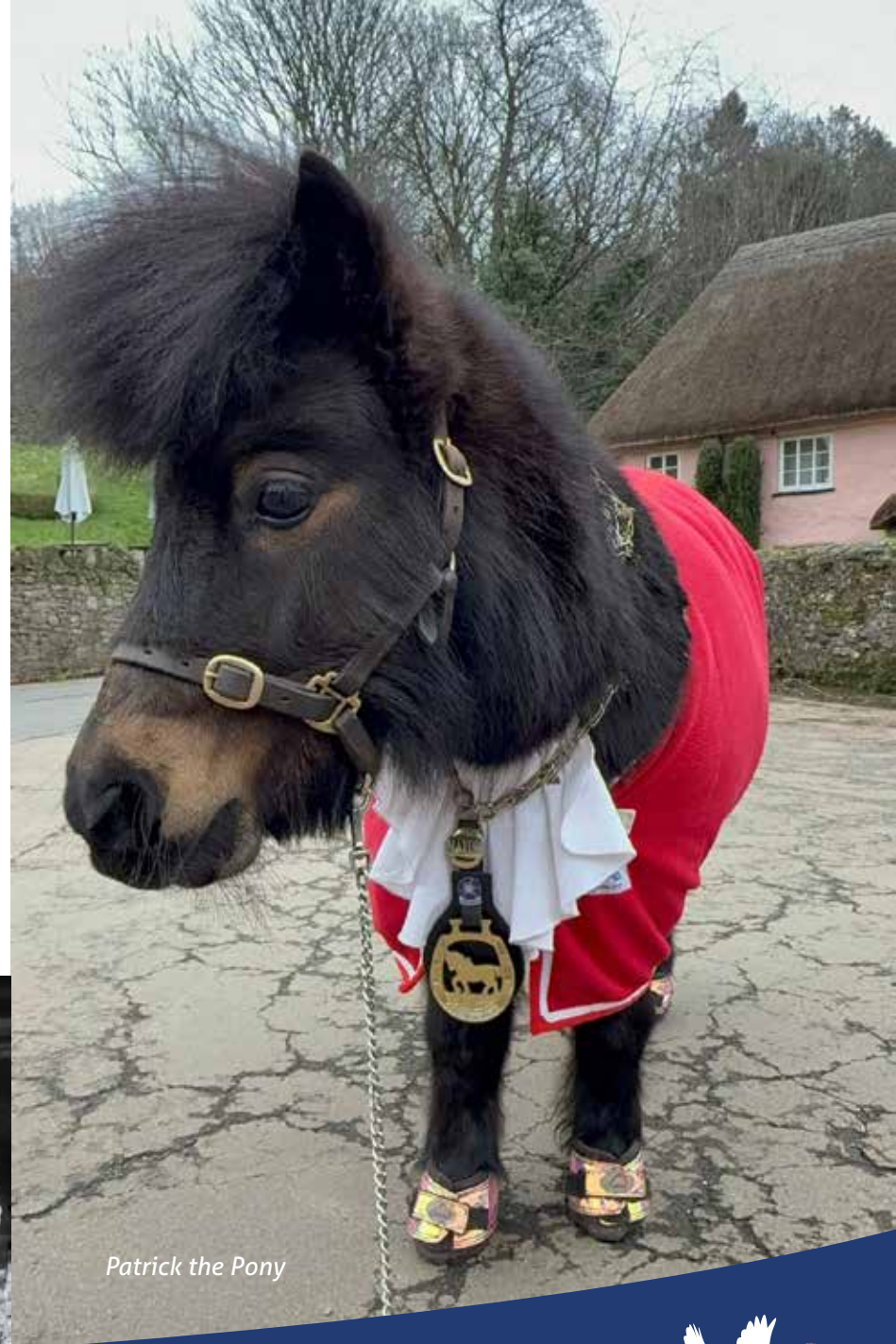
Patrick the Pony