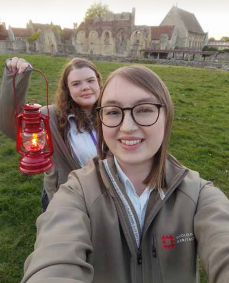
The Lamp Light of Peace at St Augustine's Abbey, Canterbury, Kent, courtesy of English Heritage.