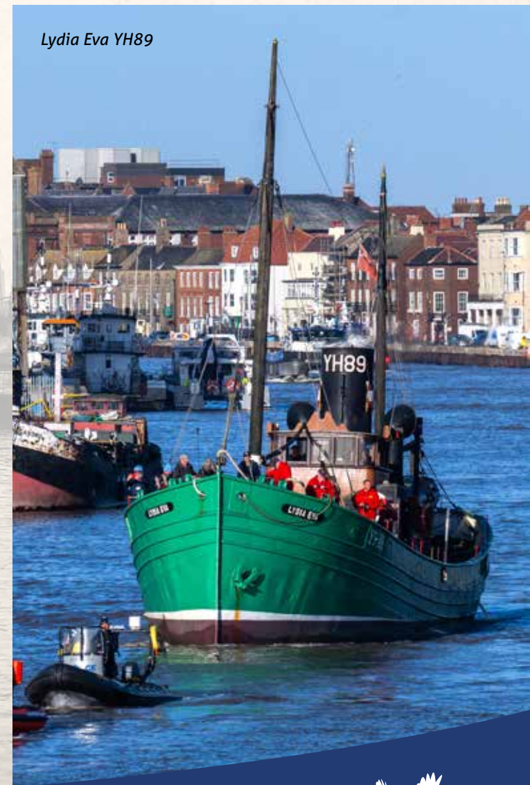
Lydia Eva YH89